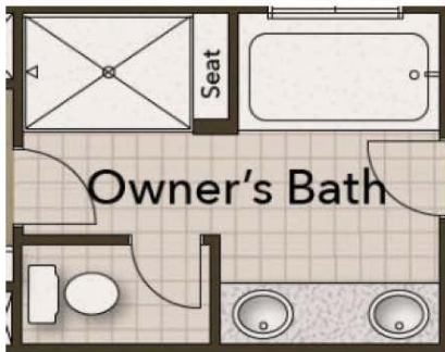
Deluxe Owner's Bath