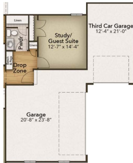
Sideload with Third Car Garage