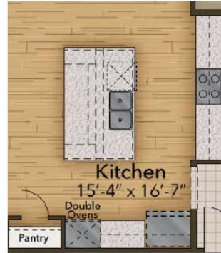
Gourmet Kitchen Island