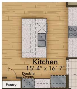
Gourmet Kitchen Island