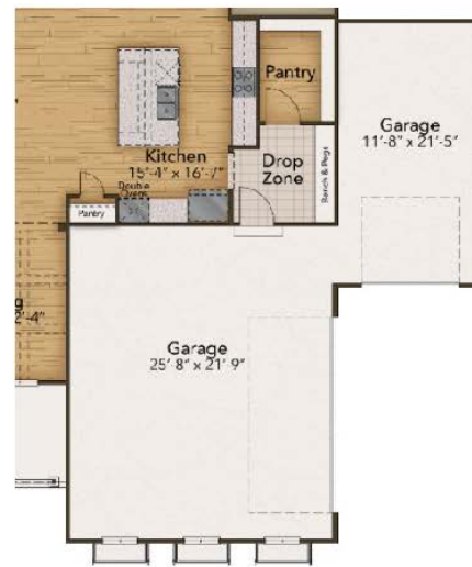
Sideload Three Car Garage