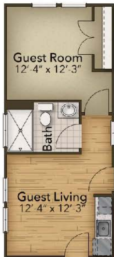
Multi Generation Suite