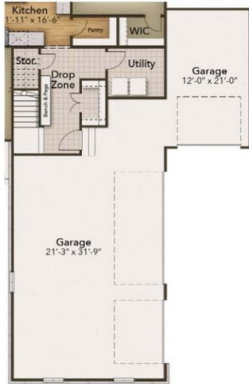
Sideload Third Car Garage with Single Car Garage