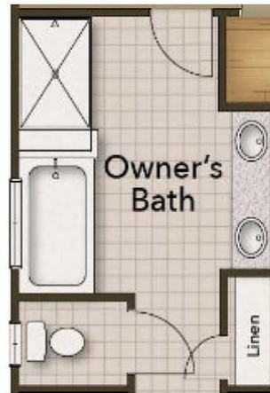
Deluxe Owner's Bath