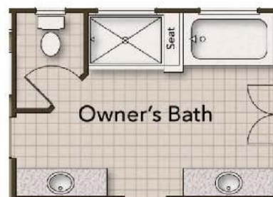
Deluxe Owner's Bath