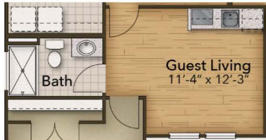
Multi Generation Suite