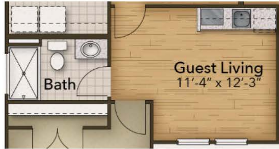
Multi Generation Suite