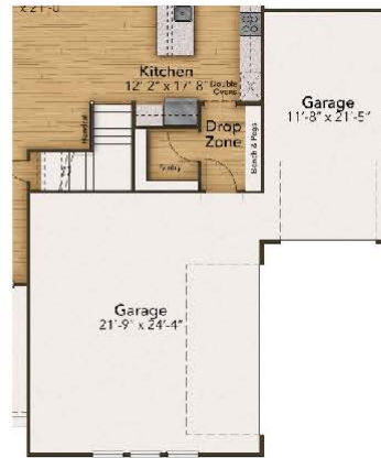
Sideload with Third Car Garage