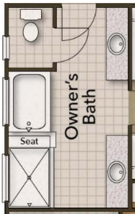
Deluxe Owner's Bath