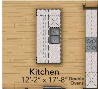
Gourmet Kitchen Island