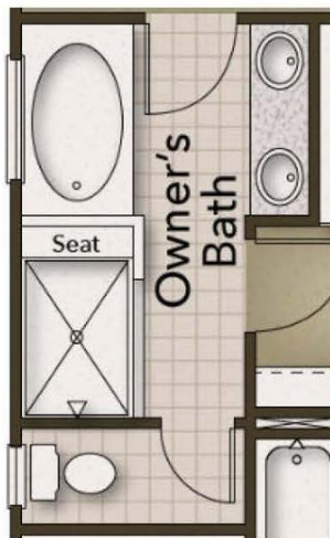
Deluxe Owner's Bath