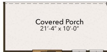
Extended Covered Porch