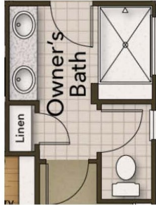
Deluxe Owner's Bath