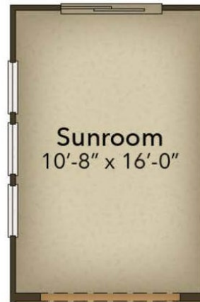
Rear Covered Porch