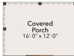
Rear Covered Porch