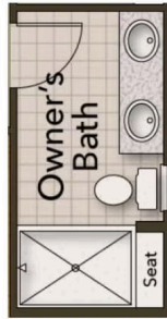
Deluxe Owner's Bath