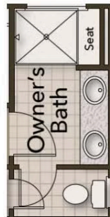
Deluxe Owner's Bath