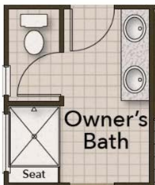
Deluxe Owner's Bath